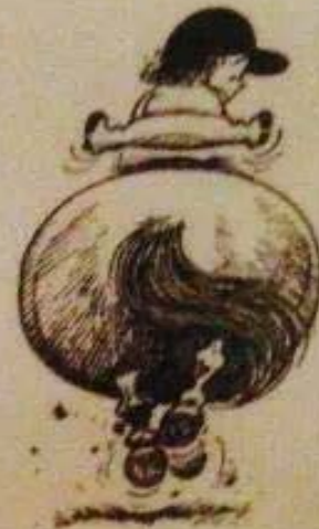
A GOOD ALL ROUNDER