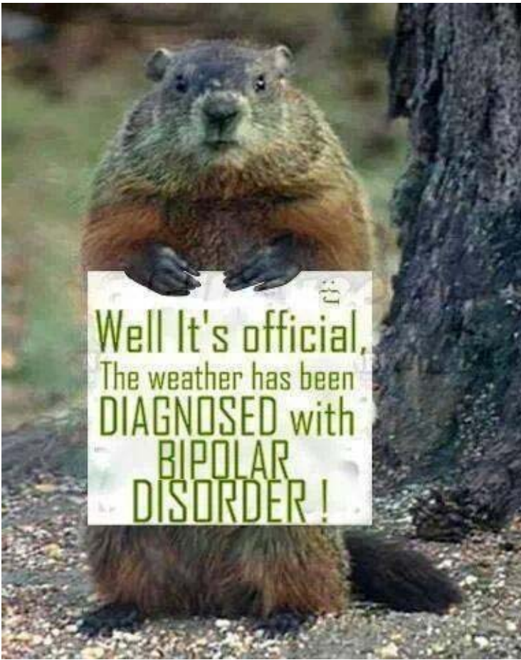
Another gem from Facebook!